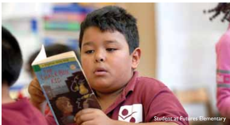
Student at Futures Elementary

Overall, 12 of our network’s 33 schools topped 700, compared to five in 2007-08, growth that reflects an encouraging district-wide trend: Oakland is the most improved large (20,000 students or more) urban school district in the state of California over the last five years. Congratulations to our schools!