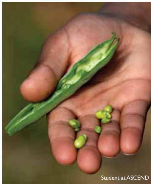
Student at ASCEND

To support the budding enthusiasm for nutrition and garden-based learning, OSSF has been busy collaborating with community organizations like the East Bay Asian Youth Center – EBAYC has set up Produce Stands on ten campuses – and partnering with the district’s Nutrition Services Department to help install salad