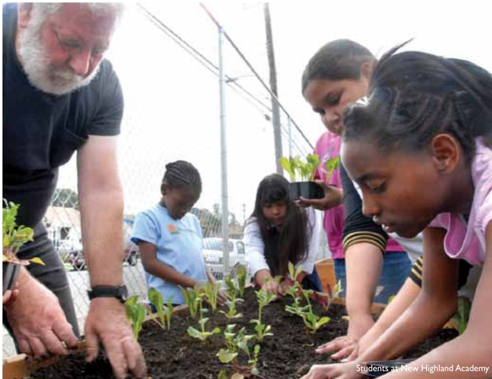
Students at New Highland Academy