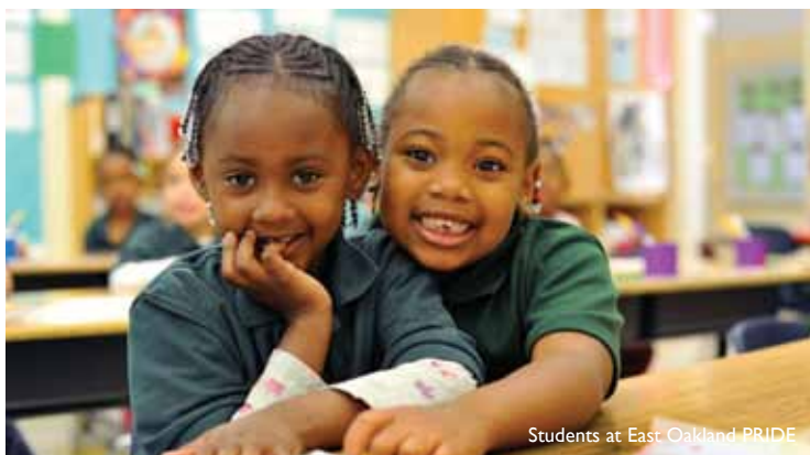
Students at East Oakland PRIDE